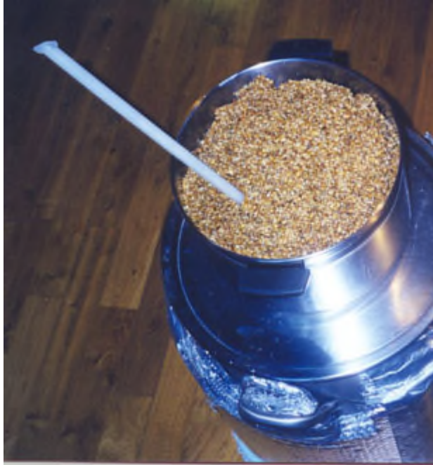
The first decoction (before the boil)