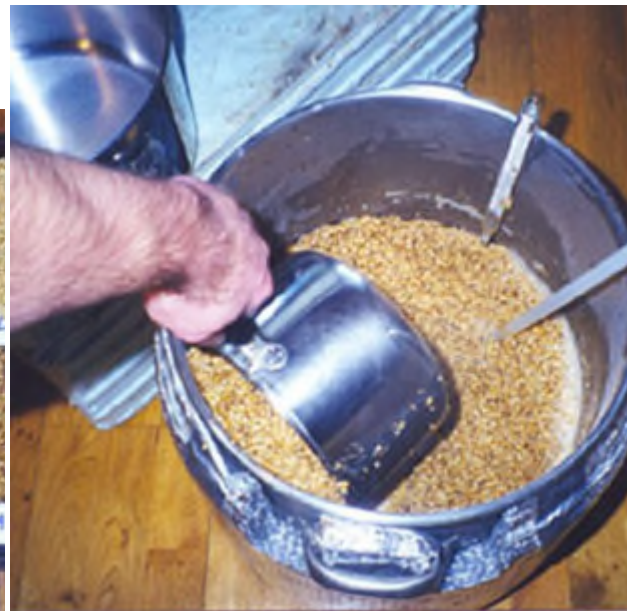
Preparing the first decoction