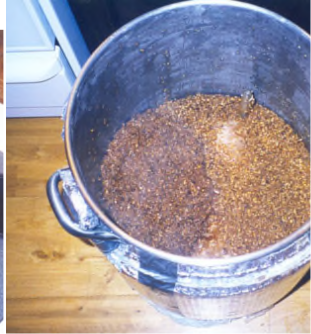
The second decoction added back to the mash