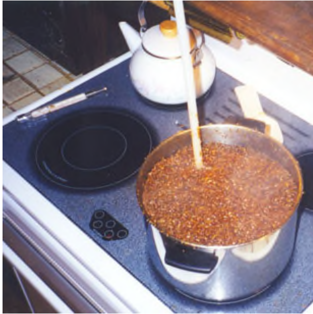
Boiling the second decoction