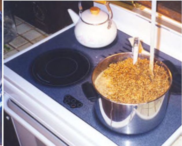
The first decoction at the conversion rest