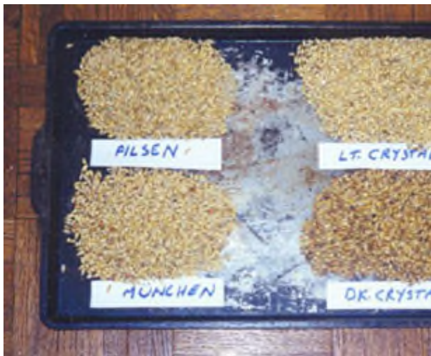
The Octoberfest Grain Bill

Ferment for 2 weeks in primary at 46-50°F. Ferment in secondary 2 to 3 weeks at 46-50°F.