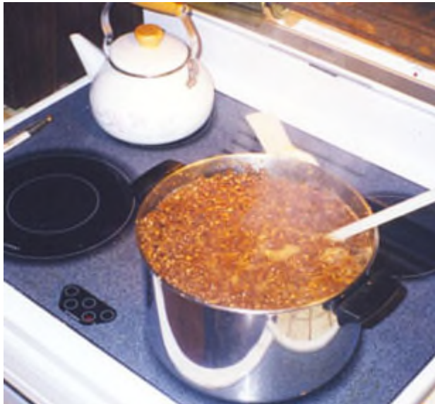
Boiling the first decoction (at the end of boil)