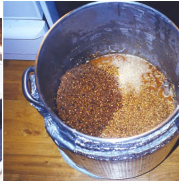
The first decoction added back to the mash